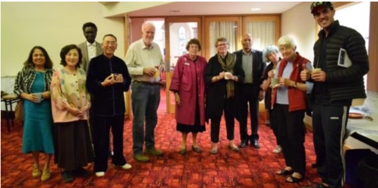
Photo: Week of Prayer for Christian Unity

Ecumenism. A vitally important aspect of witnessing to our wider community is that of ecumenism. Our inter-church events are a fitting reminder that there is more that unites than divides our differing expressions of the Christian faith. We have a particularly good relationship with both the Roman Catholics and the Uniting Church. On Palm Sunday this year, members of our three communities gathered at the Sturt Street Rotunda to herald Jesus' triumphal entry to Jerusalem and the commencement of our liturgical observances for Holy Week.