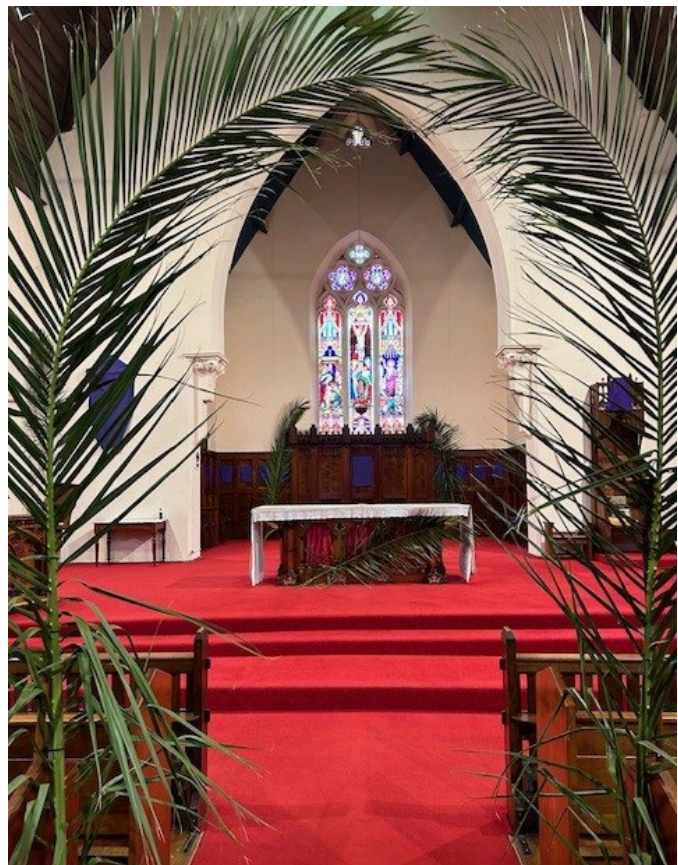
Photo: Palm Sunday

It is hard to believe this is my third annual report. Might I express from the outset my gratitude to all who serve our cathedral community in many and various capacities. We serve God's church as much in the micro as in the macro things and must never underestimate our contribution. The important thing is that we are participants in building up the kingdom of God and not merely spectators. We all have a role to play within as well as beyond Sunday worship; If you are not sure what yours is, let me know and together we will prayerfully discern what it might be.