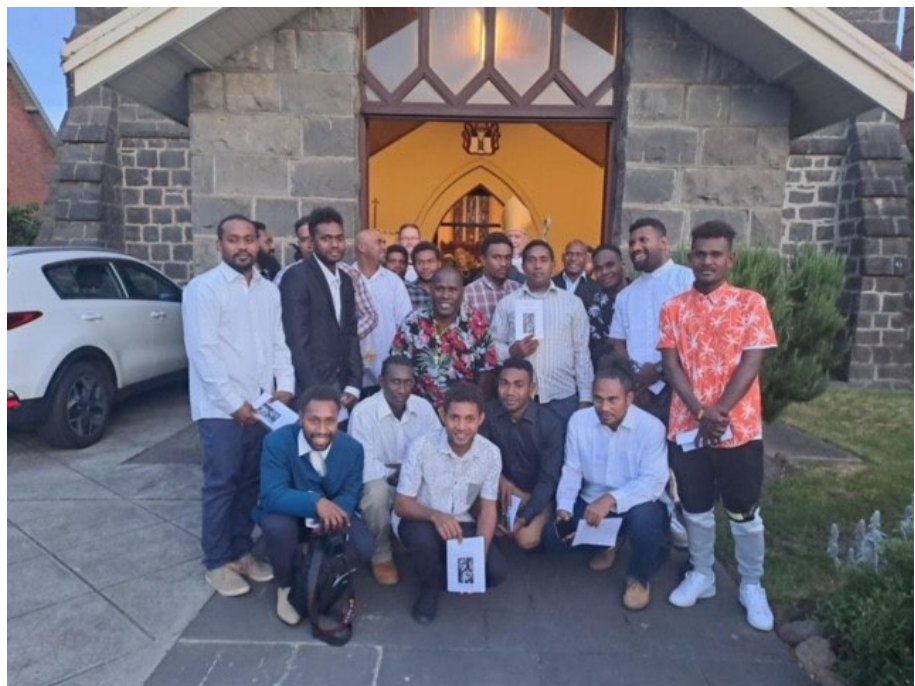
Photo: Solomon Islands Choir - 9 Lessons and Carols