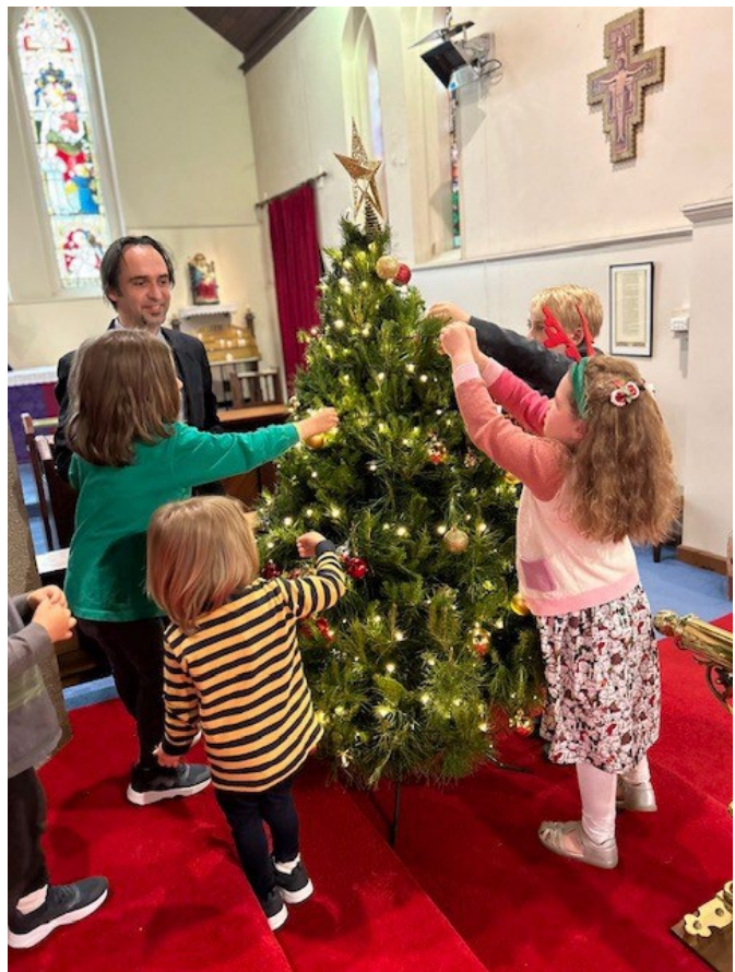
Photo: 1 Sunday School Decorating Christmas Tree