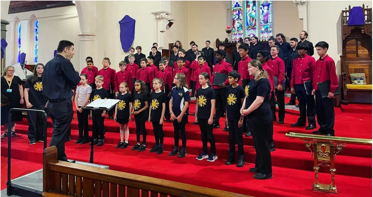
Photo: Australian Boys Choir and Ballarat Voices

First and foremost, Christ Church Cathedral is a place of worship in the heart of our city, it is likewise a public space that should offer hospitality to the arts, assorted cultural entertainments, as well as interfaith and ecumenical observances such as Harmony Day, Refugee Week, Week of Prayer for Christian Unity. The offering of hospitality to the wider community is an important witness in and of itself.